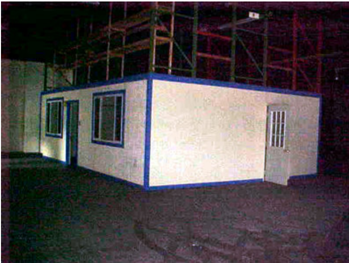
Office built out in warehouse