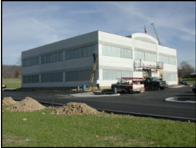
Charter's new facility takes shape (12/04/00)

"After all is said and done," More is SAID than DONE