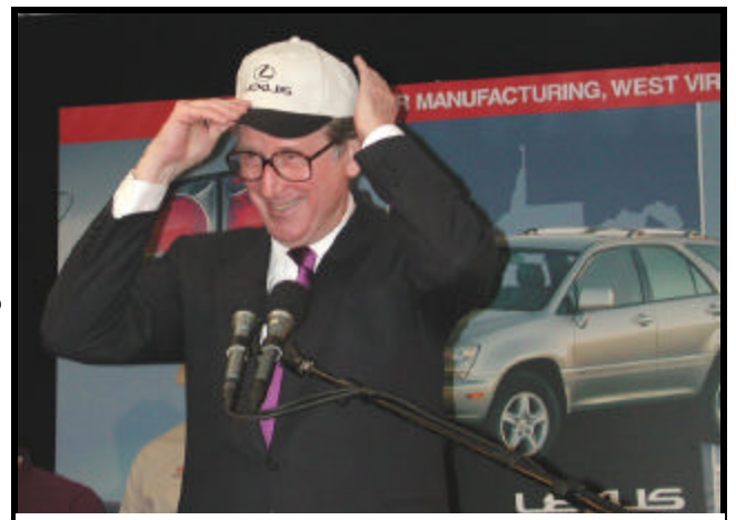
U.S. Senator Jay Rockefeller tries on a new Lexus ball cap during the announcement ceremonies. The Senator has participated in every TMMWV announcement to date.

that Toyota would come to West Virginia and set up a production plant. Close to five years ago, that dream came true," Rockefeller said, "and today I'm thrilled that Toyota is bringing their most sophisticated engine to Buffalo." "In addition to the 1,000 high paying jobs Toyota has placed in West Virginia, they have also brought prestige and recognition to our state."