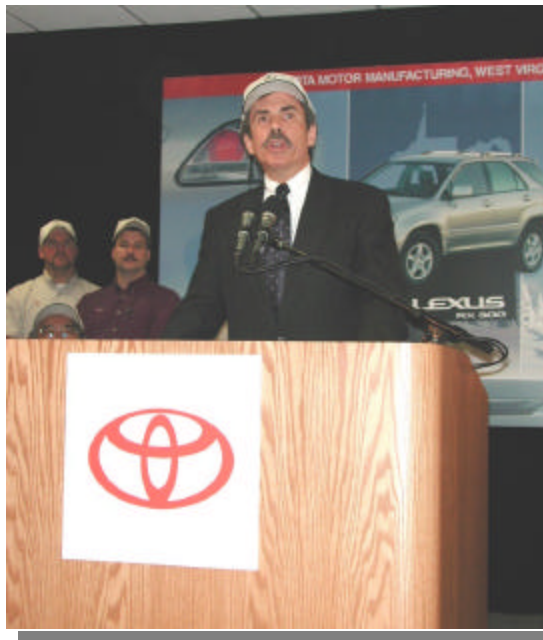
Governor Bob Wise speaks at the Toyota announcement.

Toyota’s Motor Manufacturing WV manufacturing facility includes 1.1 million sq. ft. and occupies 230 acres just south of Buffalo. Current employment at TMMWV is about 725 persons with an annual payroll of $35 million.