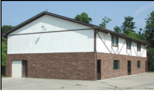
2664 Main Street, Hurricane, WV

Former T-Shirt International office, light manufacturing and warehouse space. Located at 2660 and 2664 Main Street, Hurricane, West Virginia. The buildings total 18,000 square feet and are situated on a 1.116 acre lot.