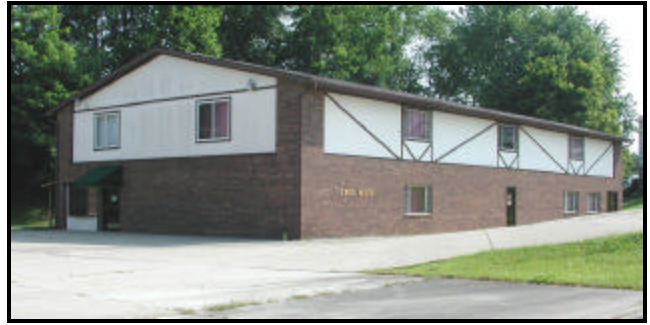
2660 Main Street, Hurricane, WV

Former T-Shirt International office, light manufacturing and warehouse space. Located at 2660 and 2664 Main Street, Hurricane, West Virginia. The buildings total 18,000 square feet and are situated on a 1.116 acre lot.