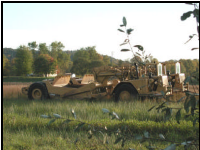
Two large pan scrapers wait for construction to begin at the Putnam Business Park site. (10/08/01)

A pre-construction conference is scheduled for October 10. At that time, the contract for construction of the replacement wetlands will be awarded to Red Dawson Construction Company for the project. Construction on the replacement wetlands is expected to begin after the contract signing.