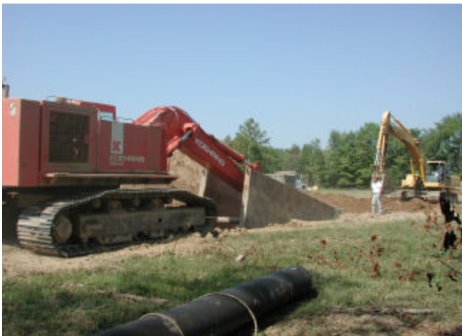
The photo above shows crews from Rover Construction installing the new sewer line on-site in the Putnam Business Park